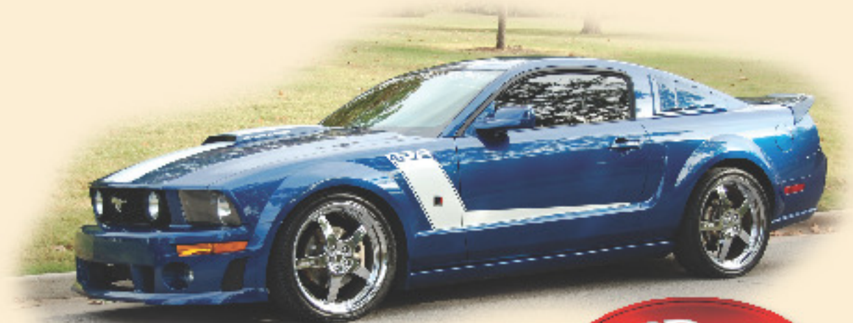
Owned by ANPAC client, Billy Ashworth