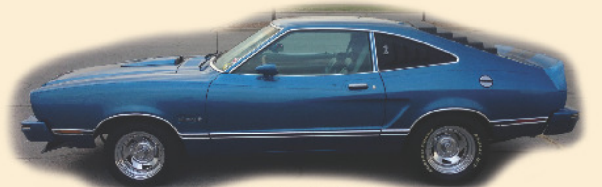
Owned by ANPAC client, Scott Cool

™ Vehicle must be at least 25 years old, *Restored to original condition